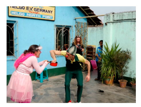
Clowns without border in Spring in Liluah

On cultural events such as concerts or shows many children always showed up to see it with their guardians. The children themselves organised a performance as well on Teachers Day and got much praise for a wonderful event at the end of the day.