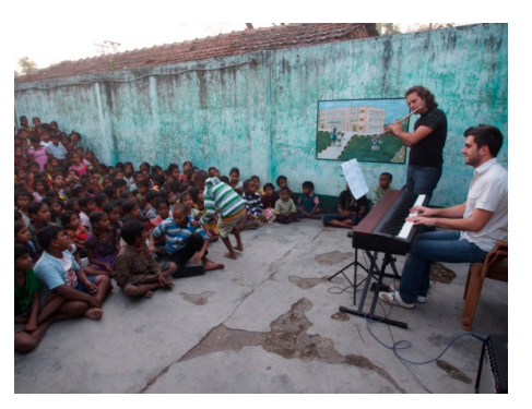
Keys of Change in November in Liluah