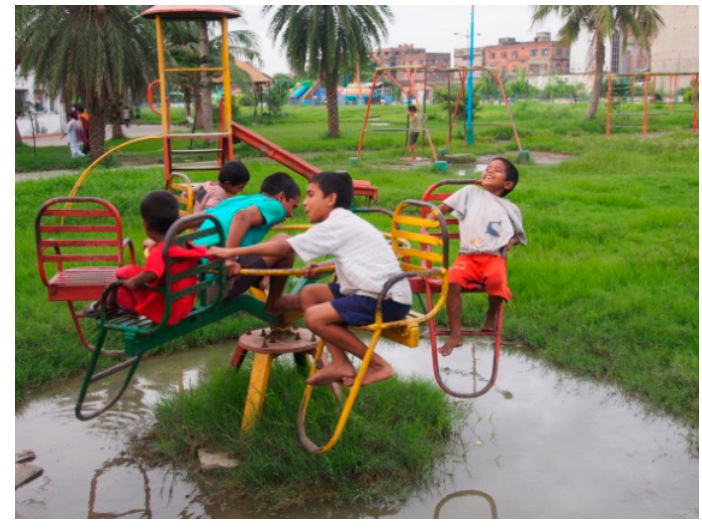
Hostel children playing in Belilious Park during their regular visit three times a week.

As all other children, the Hostel boys take part in the routine of the coaching classes but receive moreover extra help and enjoy extra activities and facilities which most of the other Project-children, who stay with their parents at home, do not get. Among the Hostel children there is a friendly atmosphere and they support and care each other like brothers. In general, the Hostel gives the children the necessary environment for education and development.