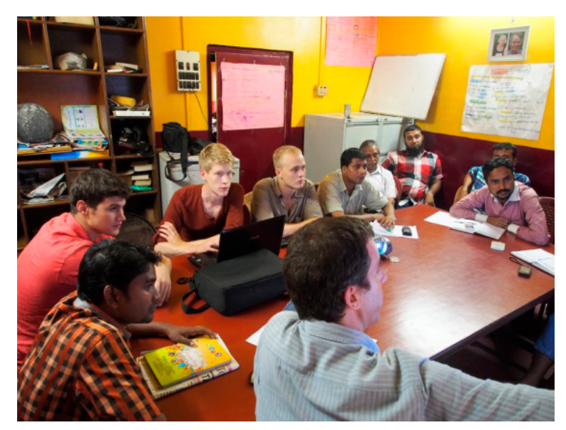
Weekly Tuesday Meetings