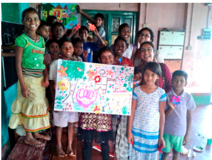
One of our regular workshops on craftwork in Liluah.