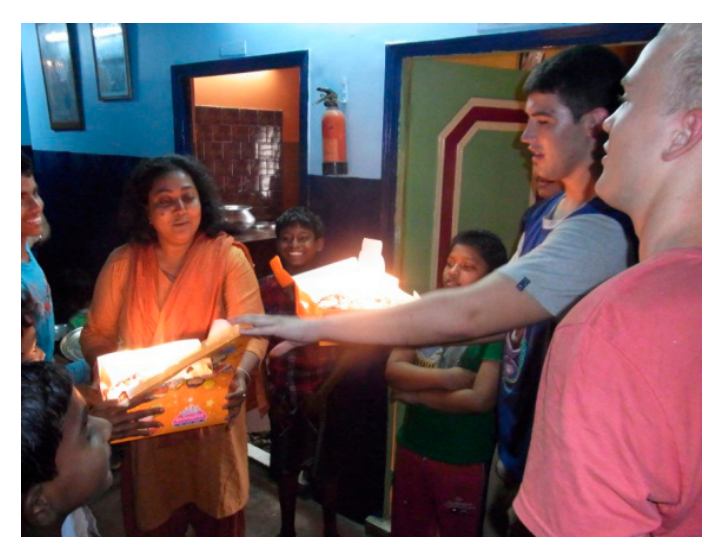
Celebration of a Birthday of a Hostel boy with the German volunteers and a social worker