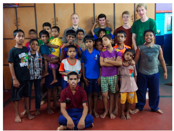
Group photo of the Hostel children with the two former and the two coming volunteers at the beginning of August