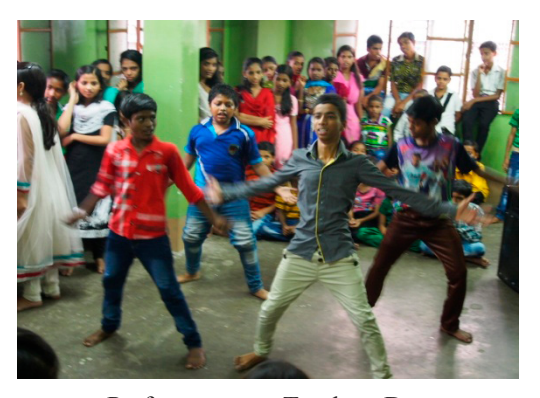
Performance on Teachers Day